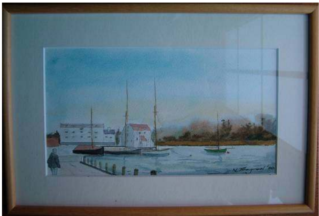
Fig 3 - Woodbridge Tide Mill