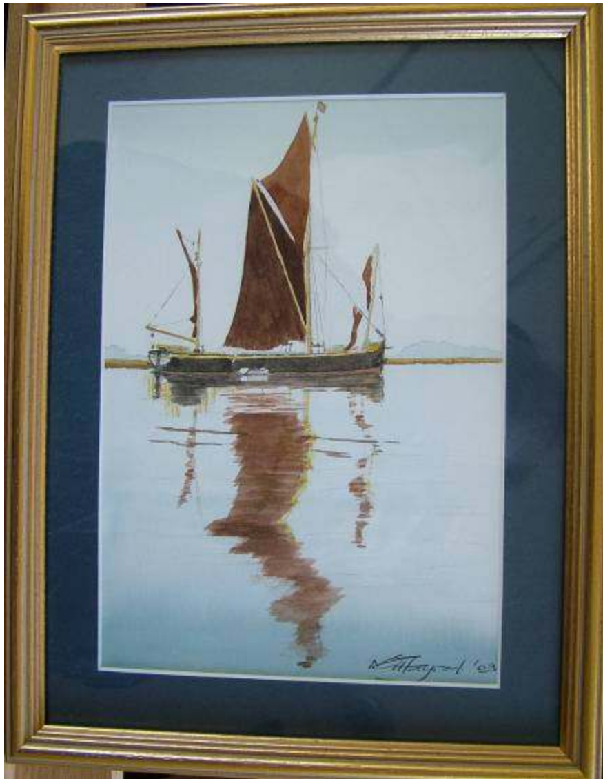
Fig 4 - Reflections - Sailing Barge Thalatta