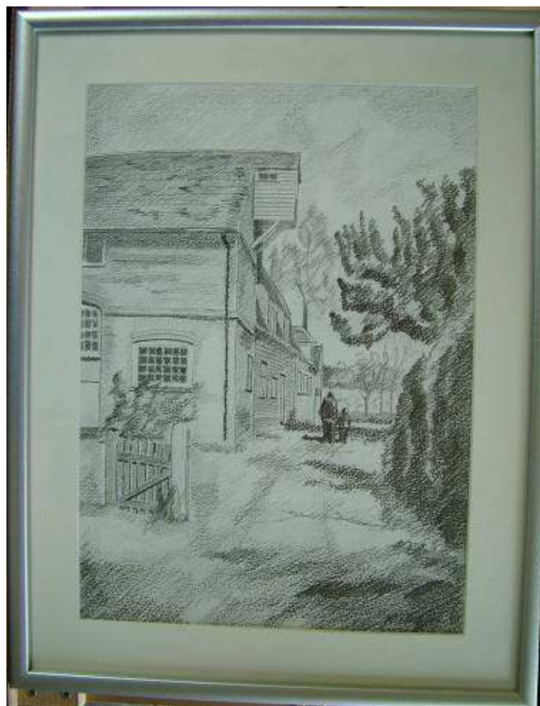
Fig 18 - Flatford Mill, pencil