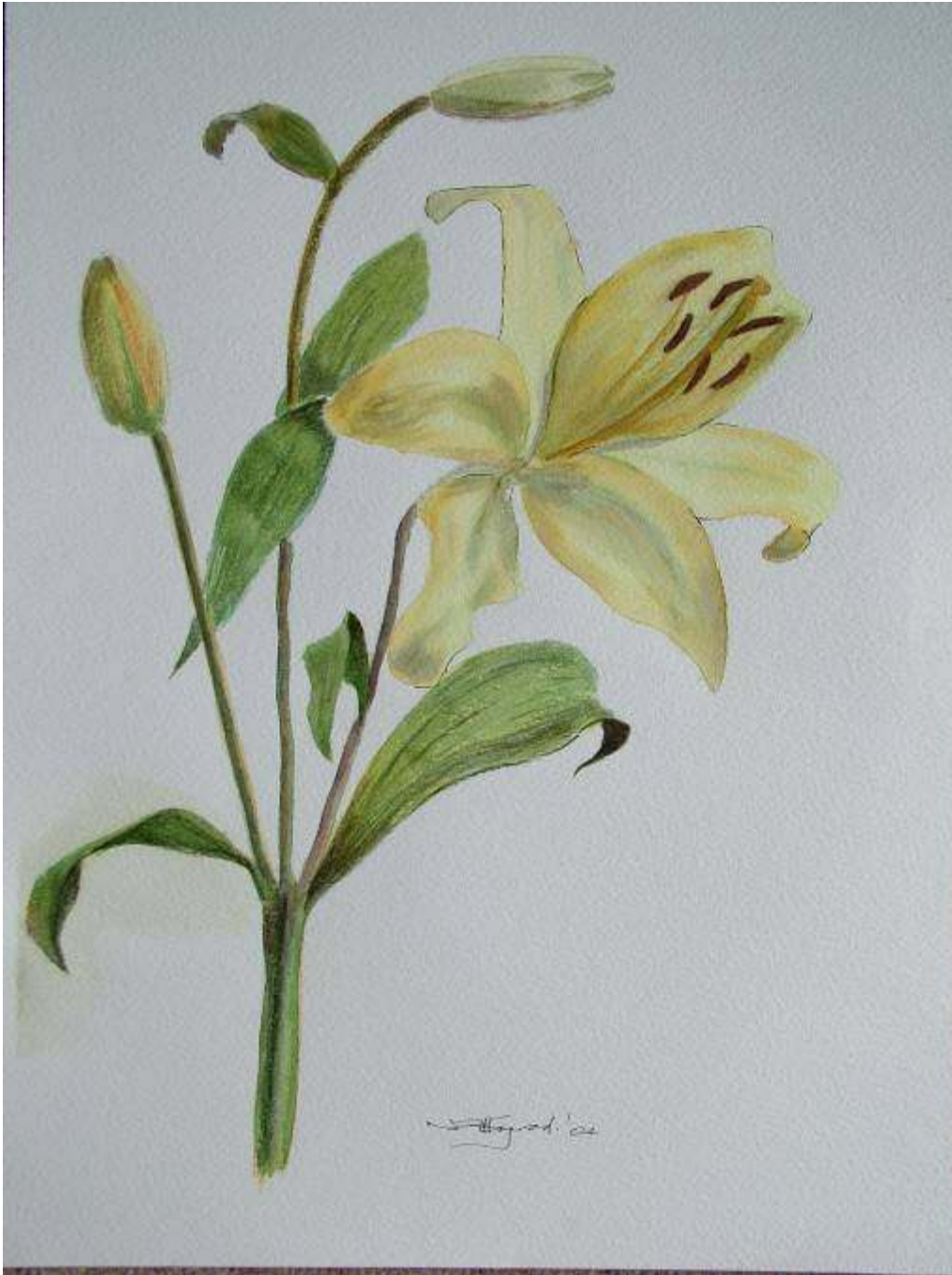
Fig 10 - Still, life?