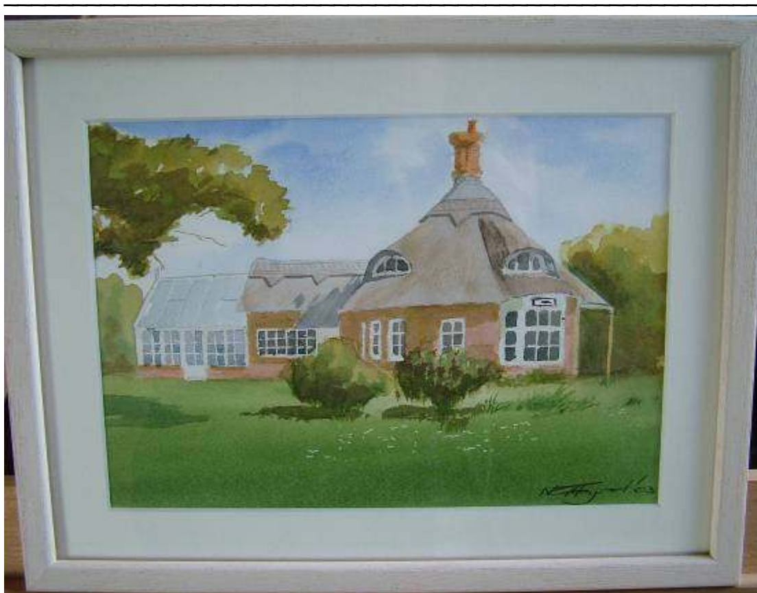
Fig 8 - The Round House