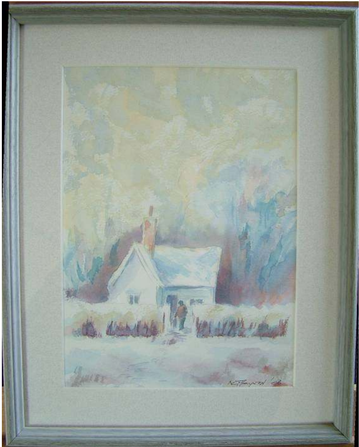
Fig 20 - Bitter Winter, warm fire