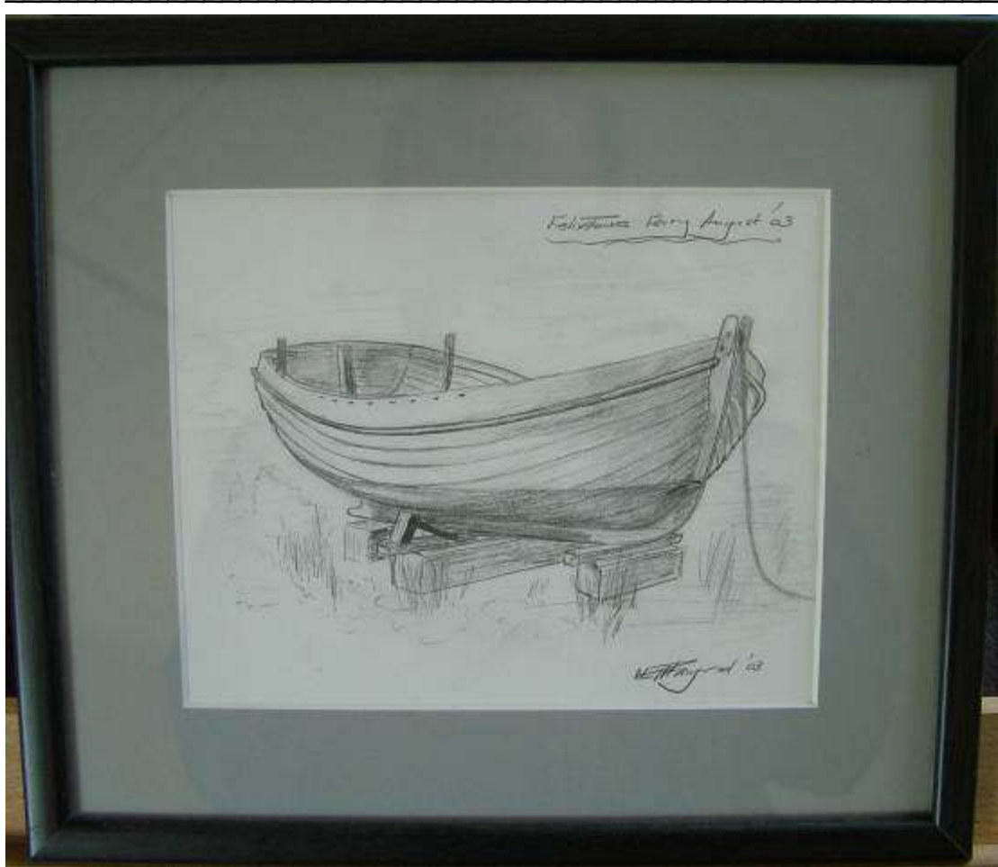
Fig 5 - The art of the craftsman