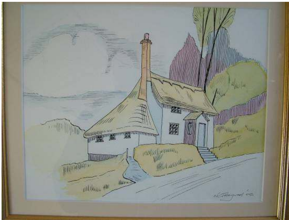
Fig 12 - Imagination - 3 colours