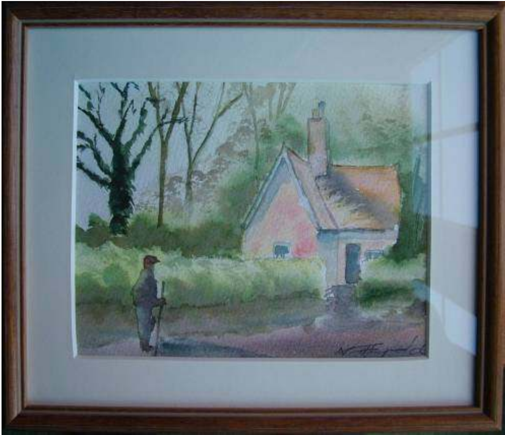
Fig 21 - Springtime