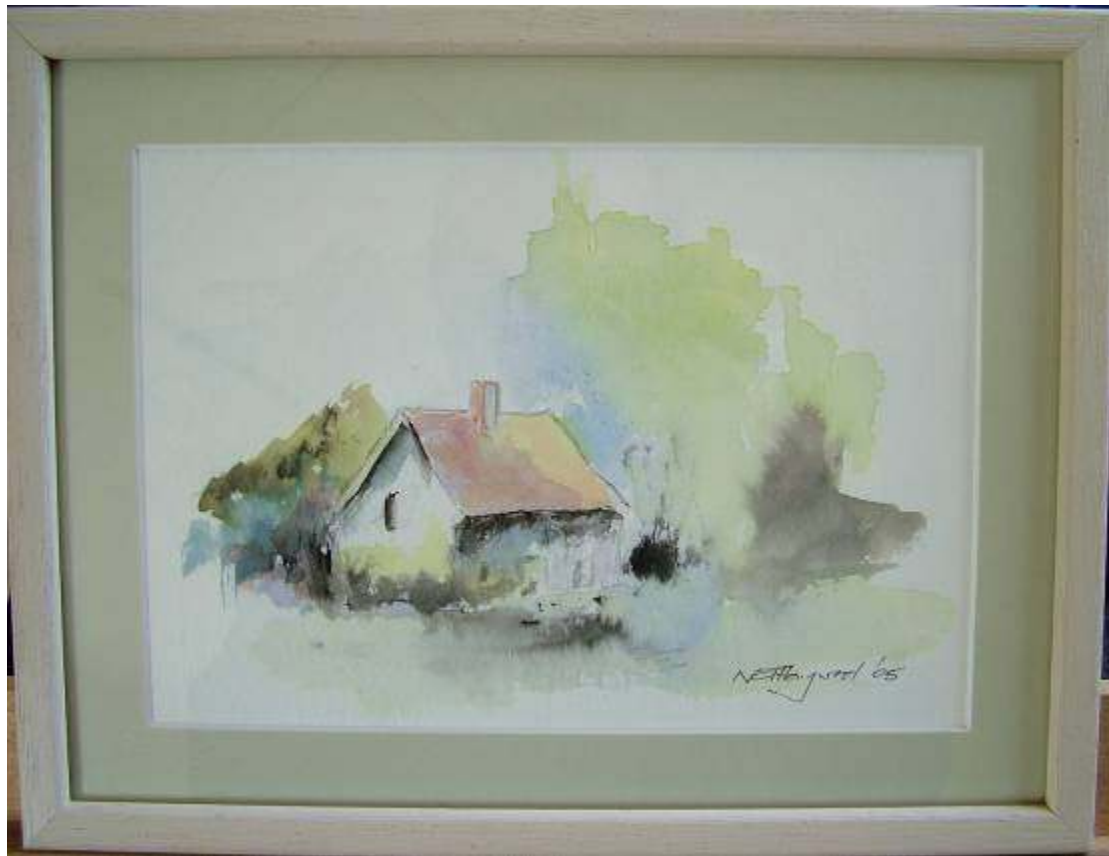
Fig 15 - Hideaway Cottage