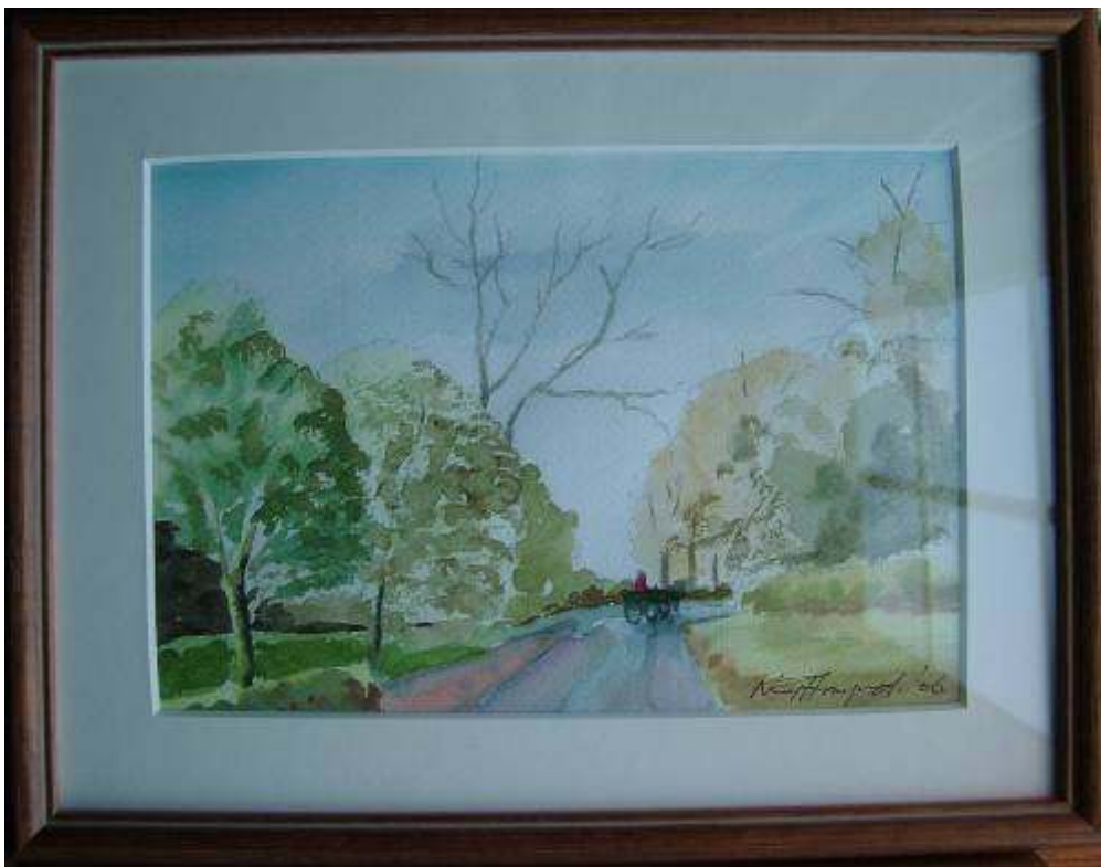
Fig 22 - Leaving Brandeston