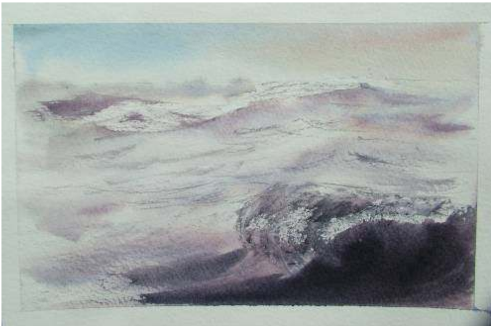
Fig 24 - The welcome dawn after a night passage