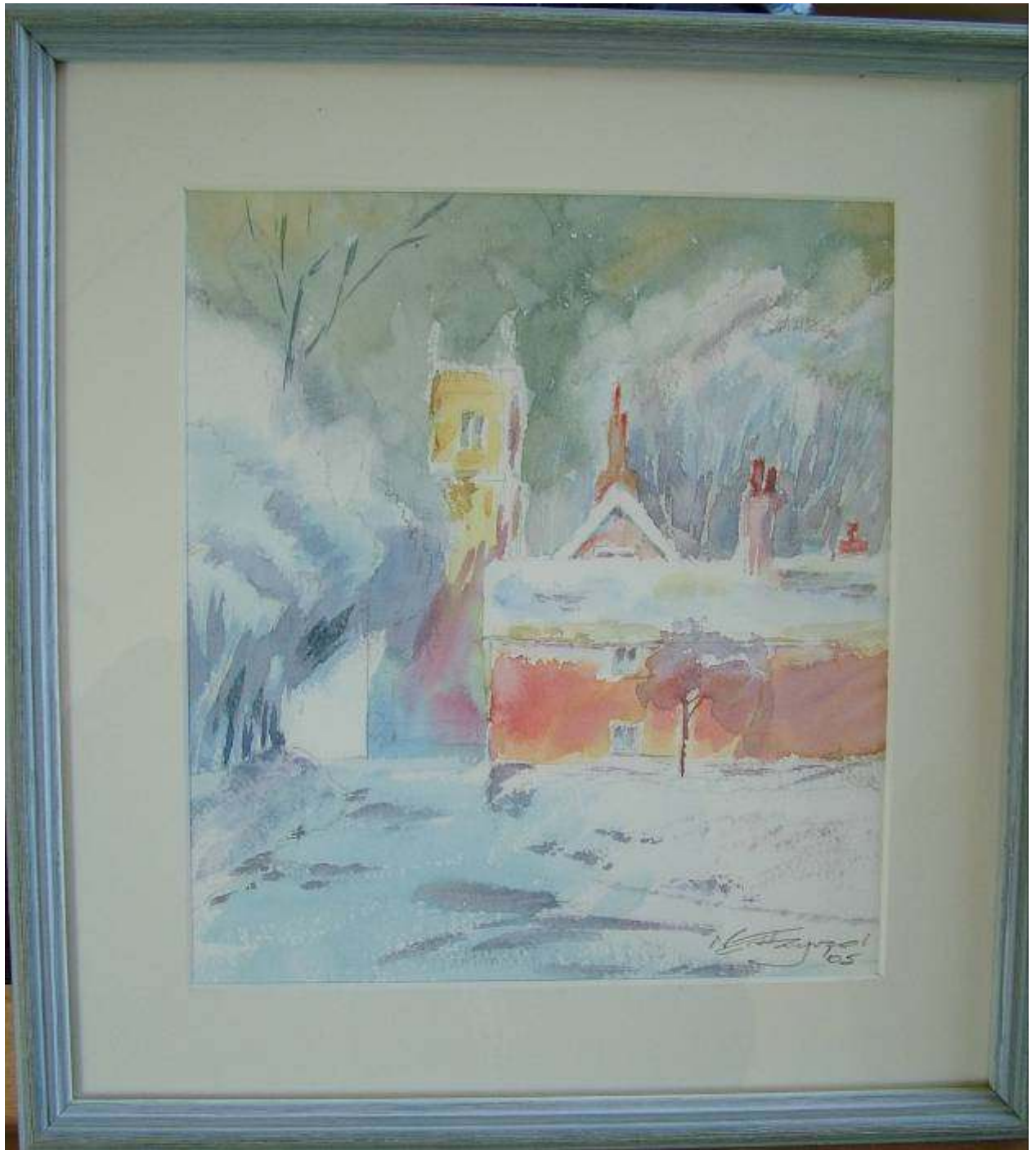
Fig 19 - Lower Ufford, Winter impression