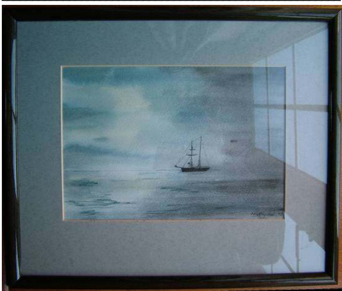
Fig 2 - Awaiting the tide, Harwich Approaches