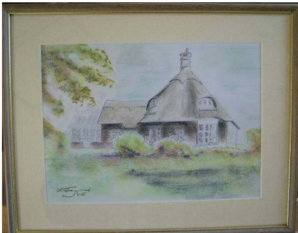
Fig 9 - The Round House, pastel