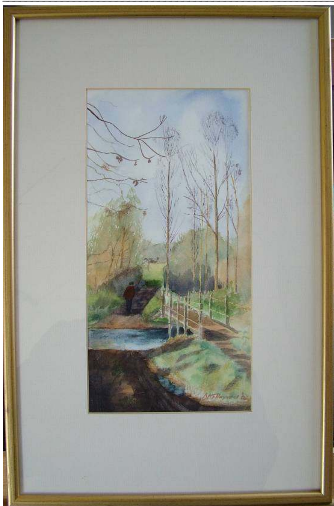
Fig 6 - The Ford, Brandeston