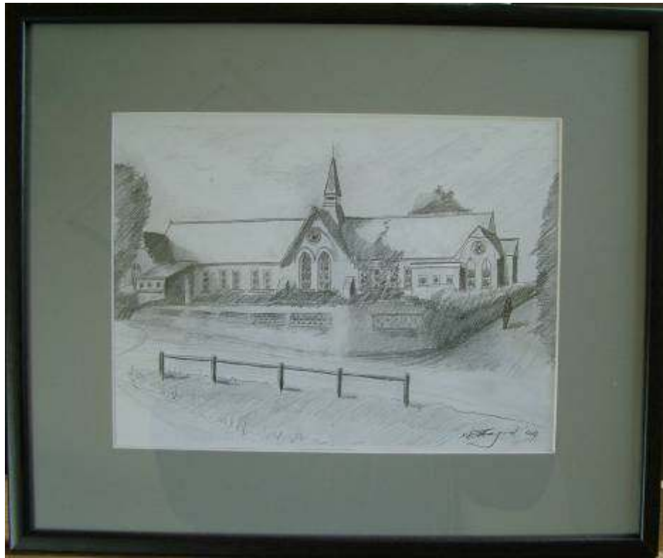
Fig 11 - Grundisburgh School, pencil