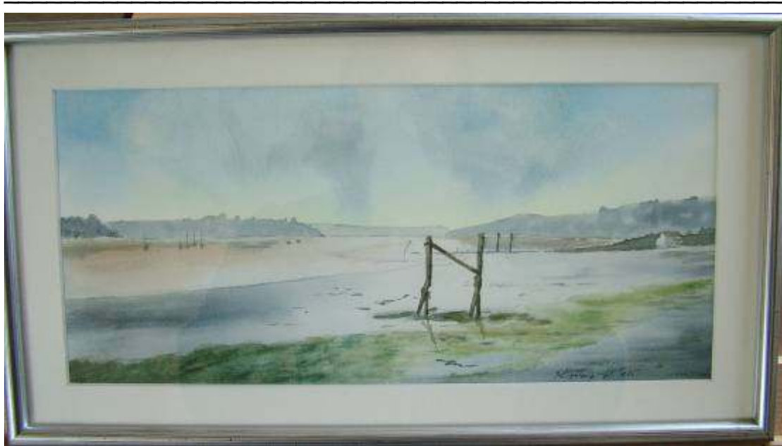
Fig 17 - The Stour and mudflats