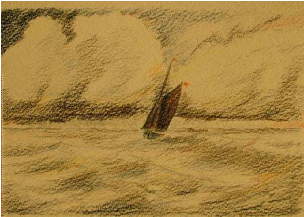
Fig 23 - Storm a' brewin', seeking shelter