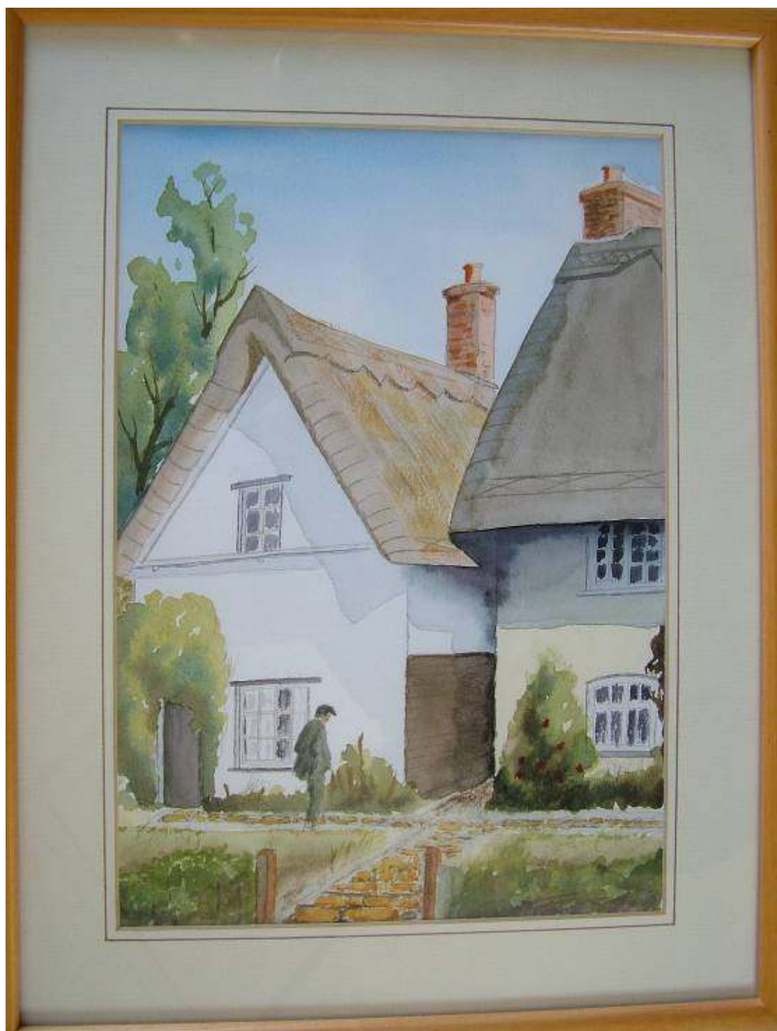
Fig 7 - Abbott's Cottage, Brandeston