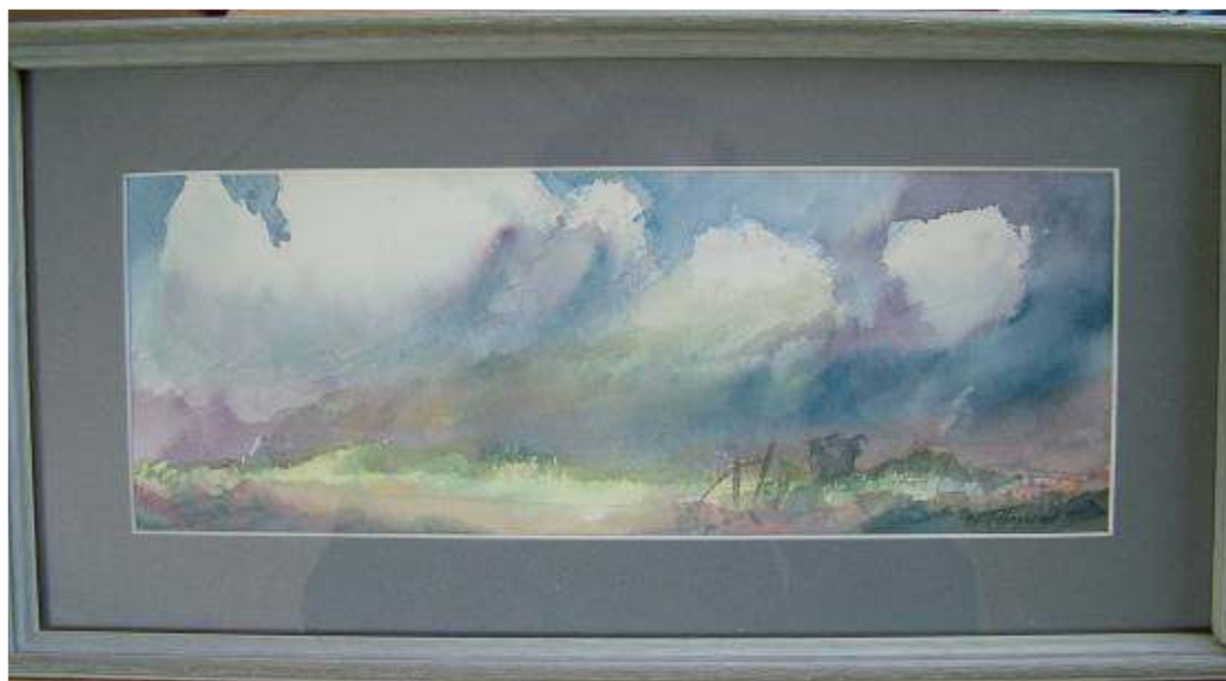
Fig 16 - Wild Suffolk Sky