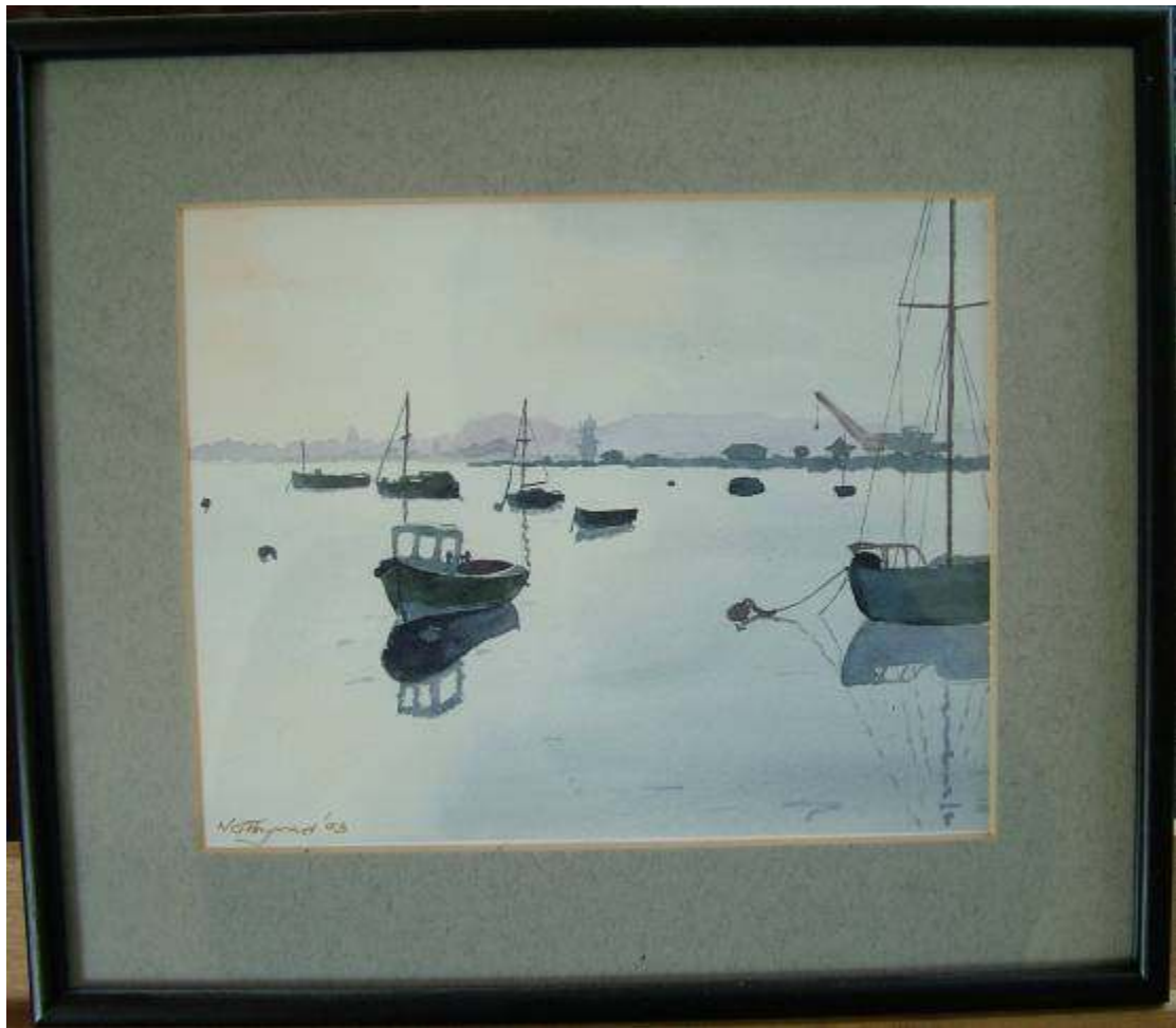
Fig 1 - Woodbridge at peace, early evening