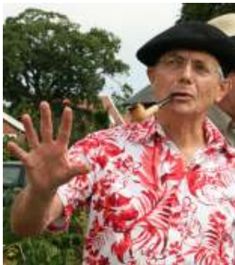
This dodgy-looking Frenchman was one of the many Brandies who celebrated the jour de fete

Takeaway fish & chips - phone your order to 685307