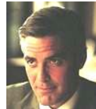
The editor: 'charming'

Proud representatives of the parish council received the award among the celebs at the glittering surroundings of the Suffolk Association of Local Councils AGM— £150 for the village hall, a plaque and a framed certificate.