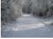
Winter wonderland: Brandeston last year

There is no need to join the getaway crowds looking for festive cheer this Christmas. As usual, Christmas in Brandeston offers everything you could ever want.