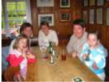
Family evenings are proving a hit at the pub. They are held on the first Friday of each month

There will also be a return of the successful 'rat down a drainpipe' competition. As before, it's worth pointing out that this is not to be confused with a rat up a drainpipe, which is quite different and could lead to unfortunate